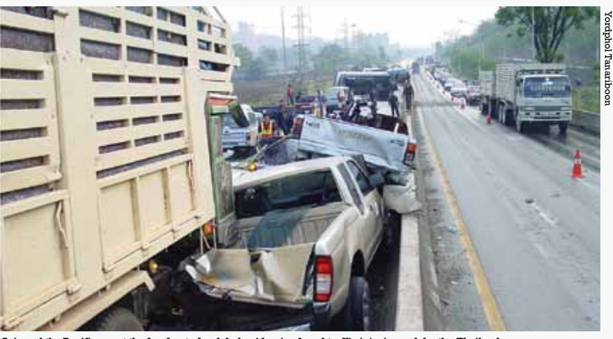
Asia and the Pacific are at the forefront of a global epidemic of road traffic injuries and deaths. Thailand

Nearly 1.3 million people are killed and as many as 50 million are injured or disabled each year due to road crashes. Lowand middle-income developing countries account for 90% of road deaths, although these countries only have 50% of the world's motorized vehicles. By 2020, road crash deaths are projected to increase by 80%. Globally, road crashes will become the fifth leading cause of death in all age groups by 2030.