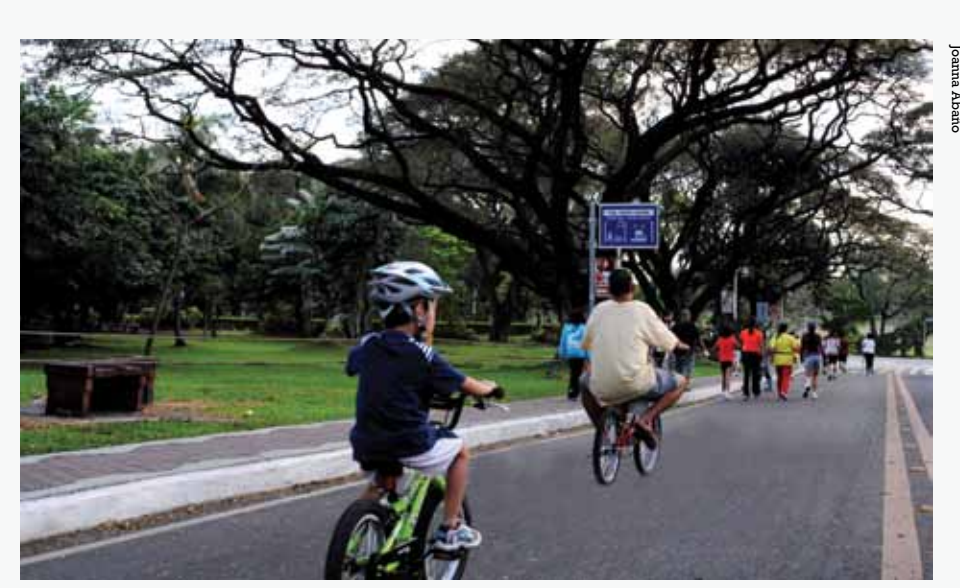
Segregated lanes for vulnerable road users. The Philippines

An electronic version of the Road Safety Action Plan is available at www.adb.org/documents/road-safety-action-plan