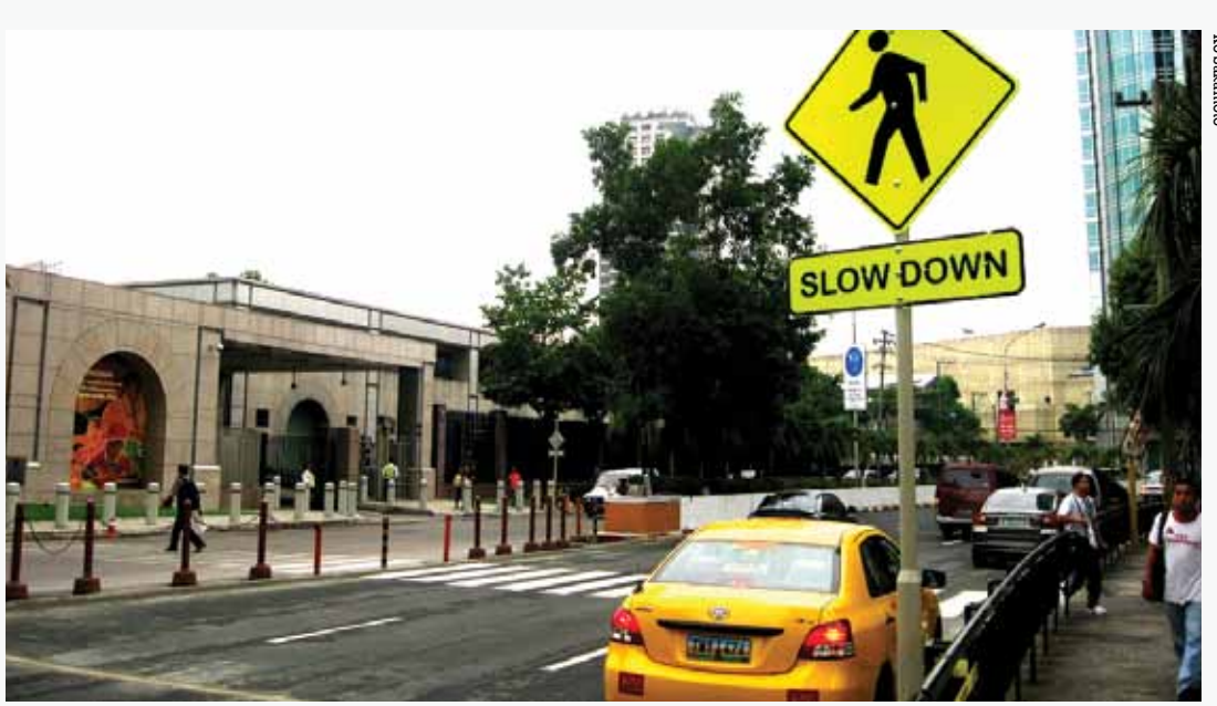
A traffic sign warns drivers of pedestrian crossing ahead. The Philippines

ADB anticipates that the first 2–3 years will be spent strengthening local capacities in road safety management, engineering, law enforcement, and other areas required for effective implementation of action plans and in preparation of road safety investment projects. This will lead to stand-alone road safety investment projects, which will include investment and non-investment components in several key sectors.