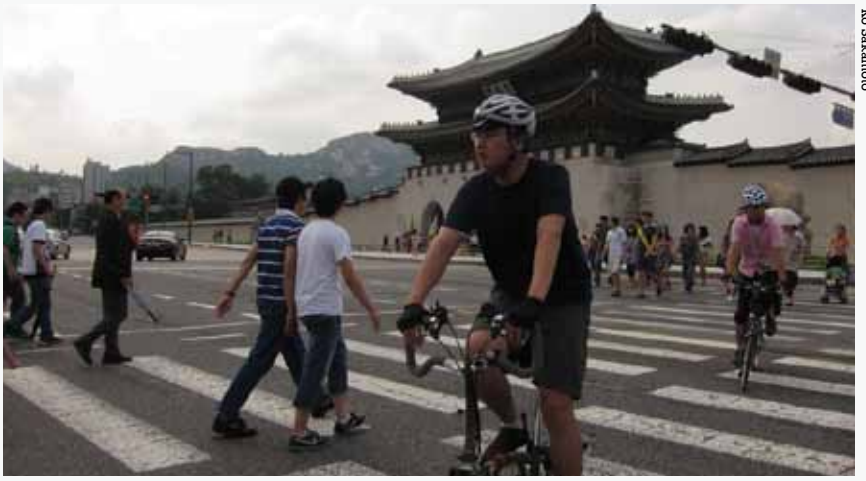
Cyclists and pedestrians benefiting from a safe road crossing. Republic of Korea

In 2010, the Asian Development Bank (ADB) established the Sustainable Transport Initiative (STI) to align its transport operations with ADB's long-term strategic framework, Strategy 2020. In addition to making its existing transport work more sustainable, ADB committed to scale up operations in four new areas: urban transport, climate change and energy efficiency, regional cooperation and integration, and road safety and social sustainability. To guide its efforts, ADB has adopted a Road Safety Action Plan. Key features are summarized below.